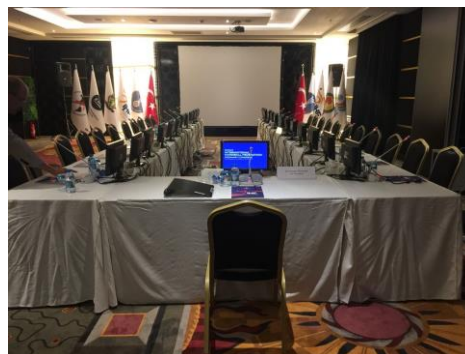
Continental Confederations' meeting rooms (examples of CAHB and OCHF):